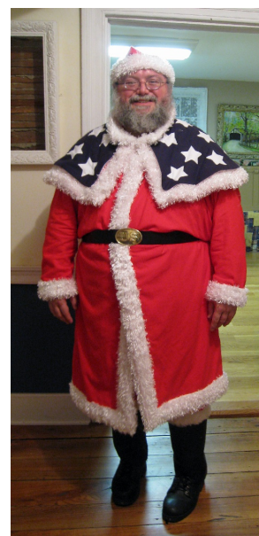
Civil War Santa

If you are able to donate a 64 ounce of bottle cranapple juice, or bake a batch of cookies, please let Polly know at 740-965-3582.