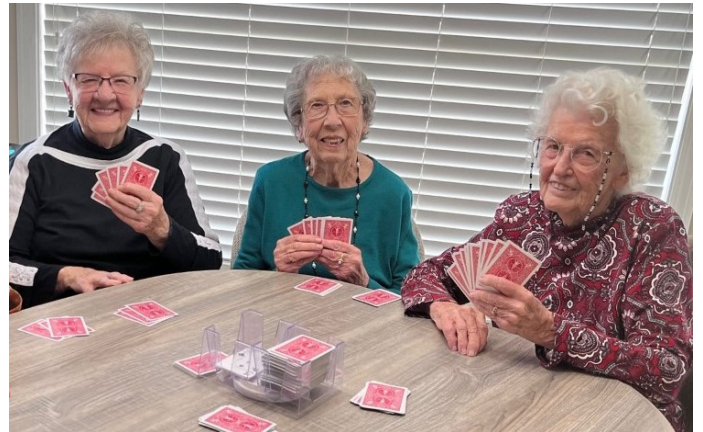
Three 90+ year olds!