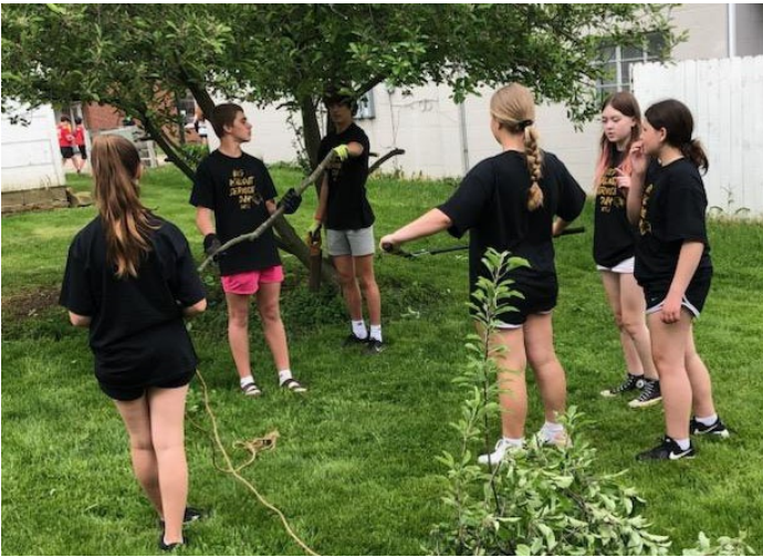
BWMS Students clean up branches from apple tree originally from Buckingham Orchard now behind Myers Inn during Community Service Day - see page one for more about the event

MYERS INN MUSEUM IS OPEN 12-3 ON SATURDAYS Special Tours maybe arranged on another day by calling 740-965-3582