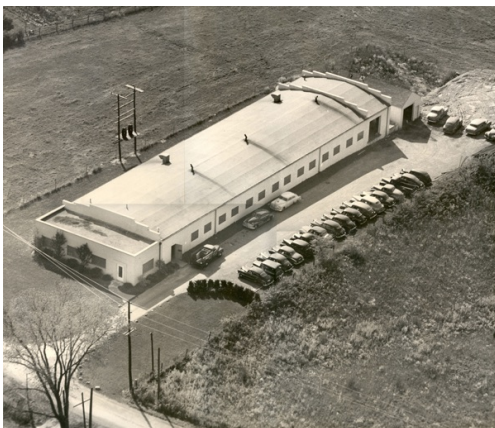
Kline Manufacturing Plant - 1950s

During WWII Uncle Sam took over many plants and used them to manufacture items needed for the war effort. Our oral history says