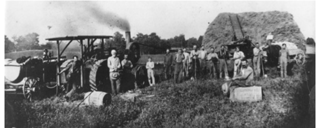
Unknown Harvesters on S. Galena Road