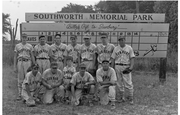
Early Team at Southworth Memorial Park on Hartford Road East of Sunbury