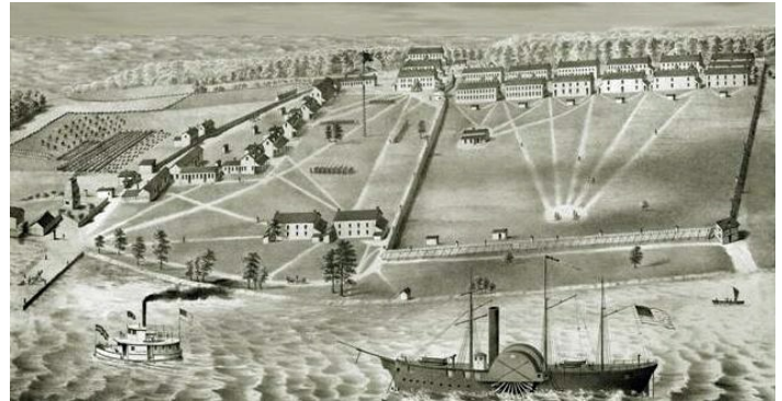
Engraving of Camp

Christmas on the Square is 4 to 8 Saturday, December 7 th