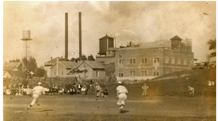
Game on Nestles' Ballfield