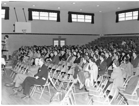
Big Walnut Highschool Gym and Auditorium on Baughman Street was built in 1951 and used today as the Intermediate School Auditorium and Gym.

The Community built the Big Walnut High School Stadium and Track with volunteer labor and donations from area business men. Bleachers were a special treat added in 1979.