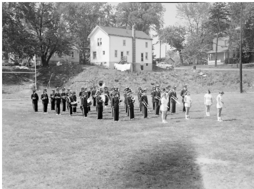
Big Walnut High School Band on former Sunbury High School football field used by Big Walnut until the new stadium and field were built. Now J. R. Smith Park.