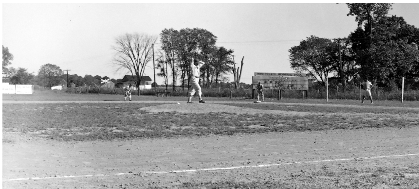
Game at Southworth Memorial Park Photo facing Hartford Road - see railroad crossing sign left of center