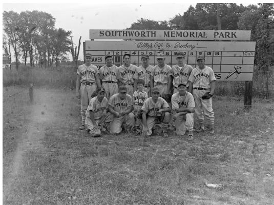
Southworth Memorial Park on Hartford Road: Billy's Gift to Sunbury