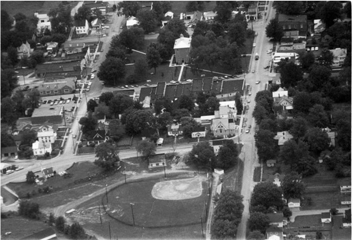
Bottom left is Texaco station where Certified is today. Playground with baseball diamond now J.R. Smith Park.